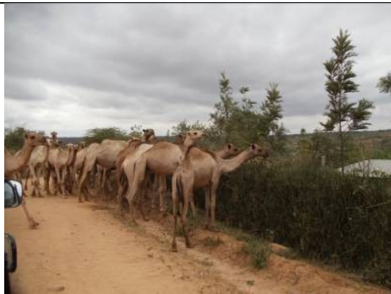
Camels on the road to Mbeere