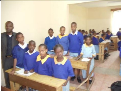
Children in new class room