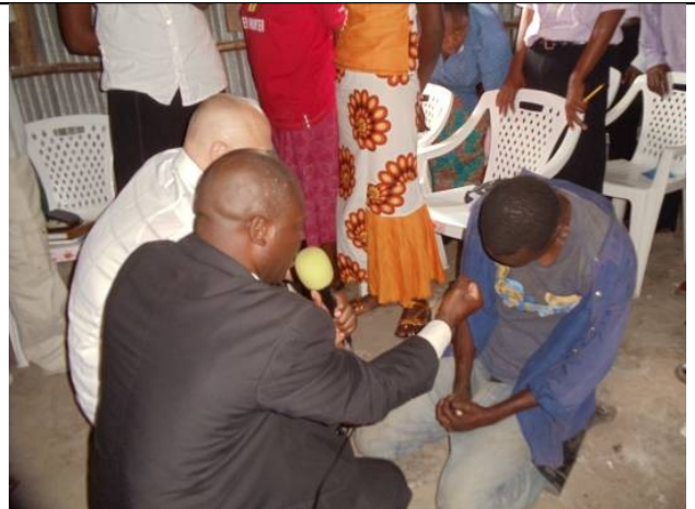
A desperate man seeks help