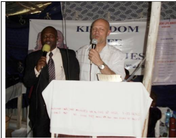
Jeremiah translated into Swahili