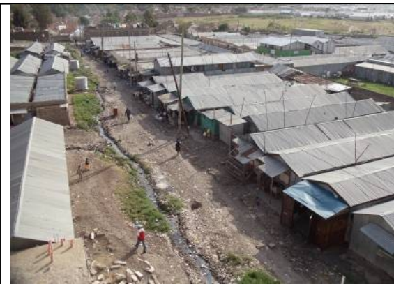
Looking down at slums of Kwa Njenga; note the open sewer and garbage everywhere